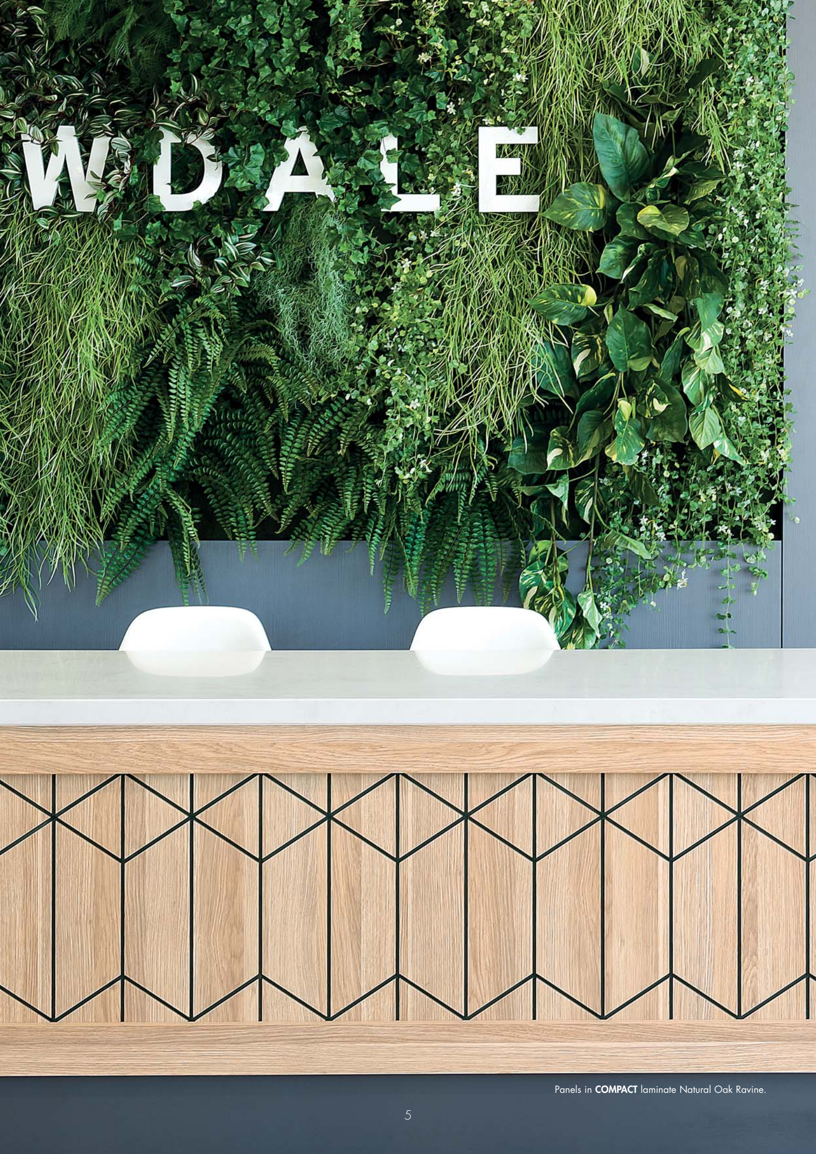
Panels in COMPACT laminate Natural Oak Ravine.